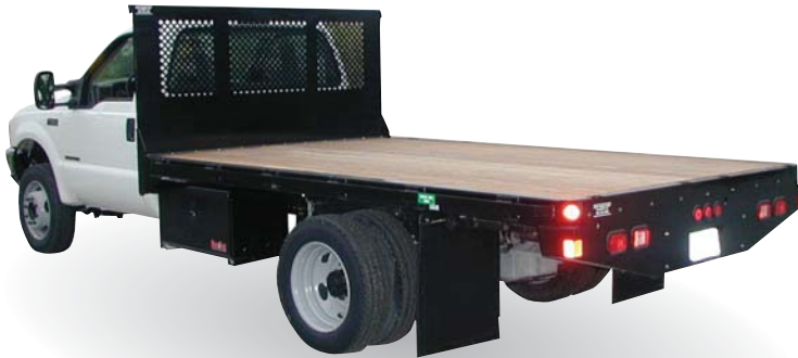
Photo is for reference only, and may not exactly represent the specifications as listed.