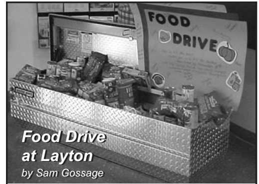
Food Drive at Layton

For the engineers, interesting and "new" situations are considered common, and they enjoy developing an endless array of solutions for customers.